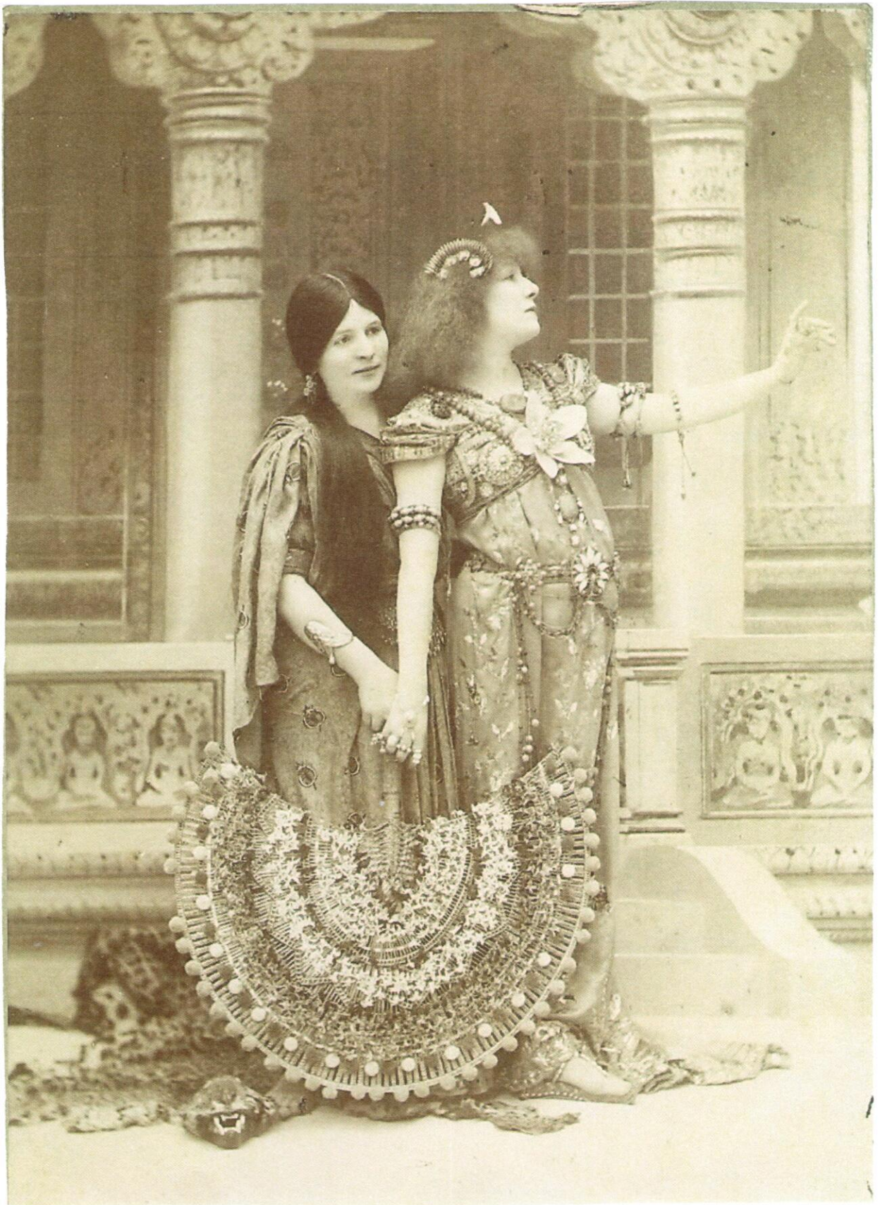
Fig. 17b) Nadar, Sarah Bernhardt as Izyel, 1894