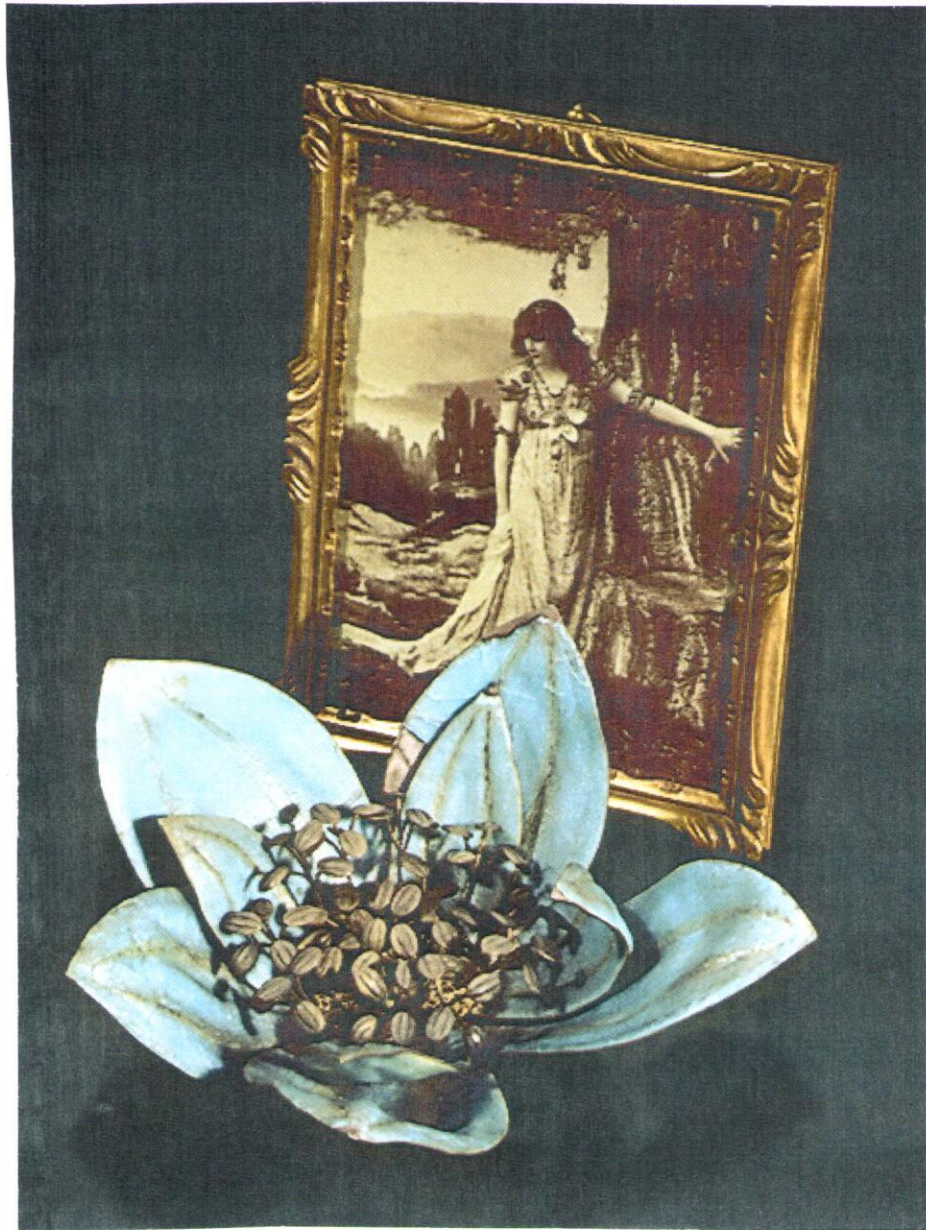
Fig. 15) René Lalique, Jeweled Flower for Sarah Bernhardt in Izyel , 1894