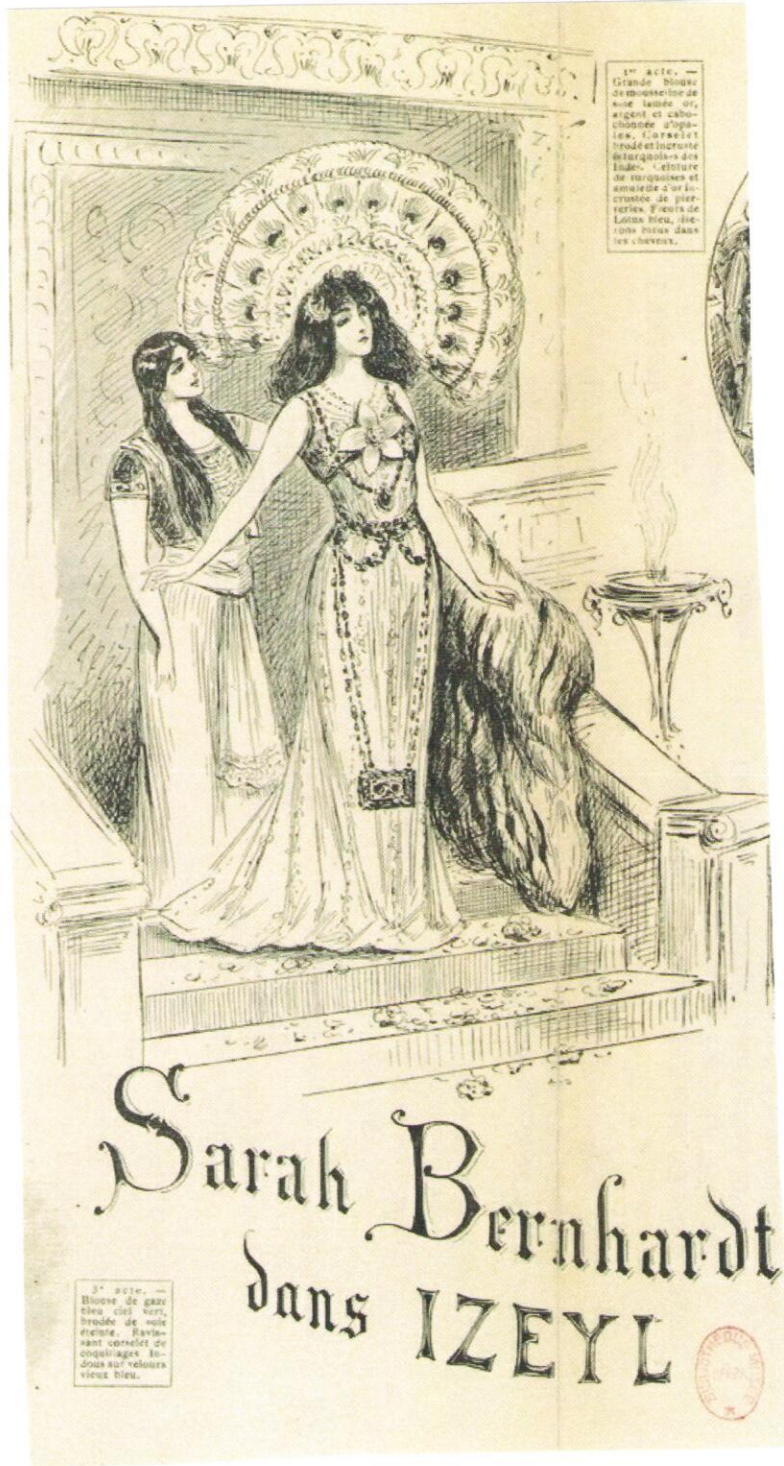
Fig. 18) Sarah Bernhardt in Izyel (detail)