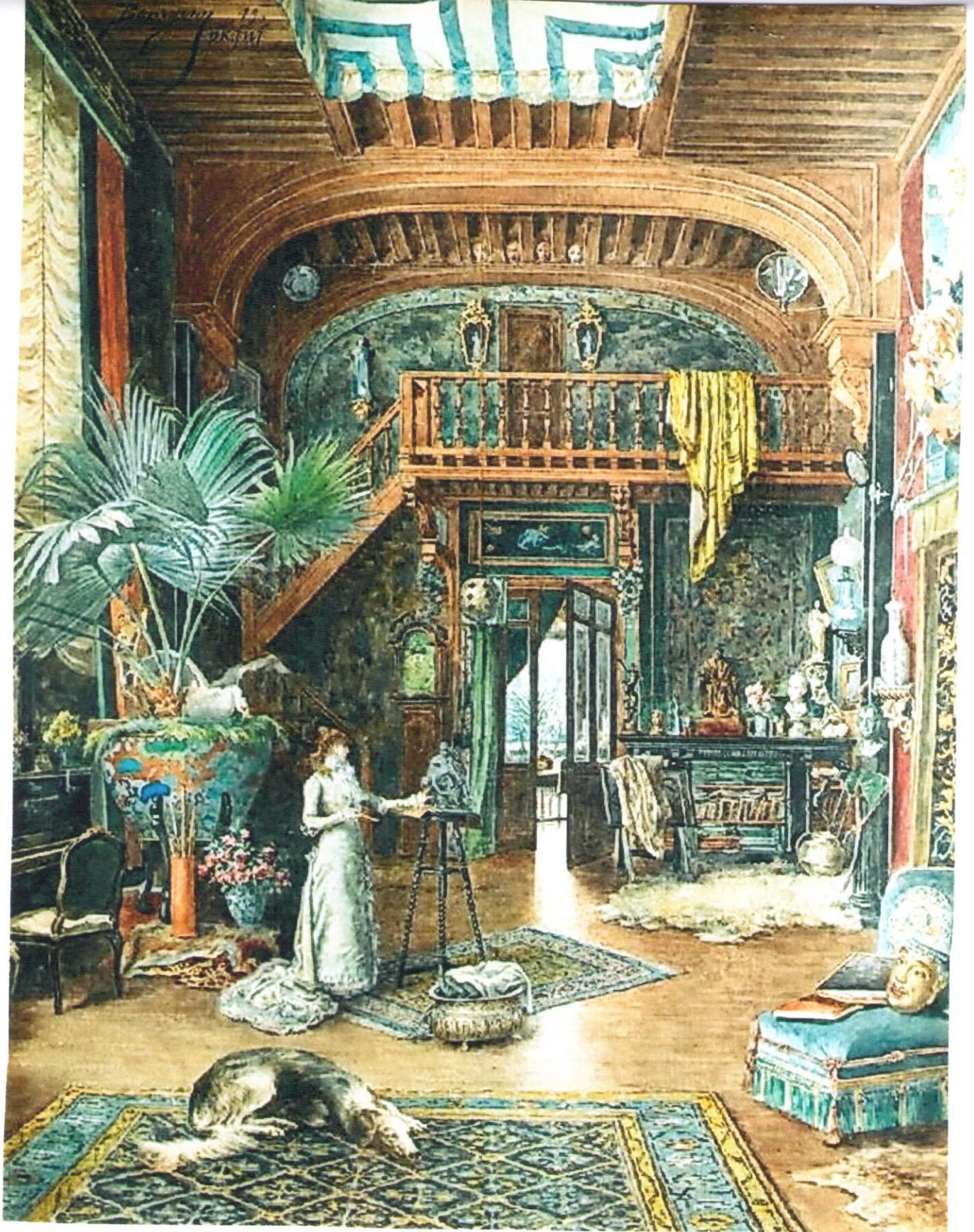
Fig. 16) Marie-Désiré Bourgoïn, Sarah Bernhardt's Studio , watercolor, 1879, The Metropolitan Museum of Art, New York.