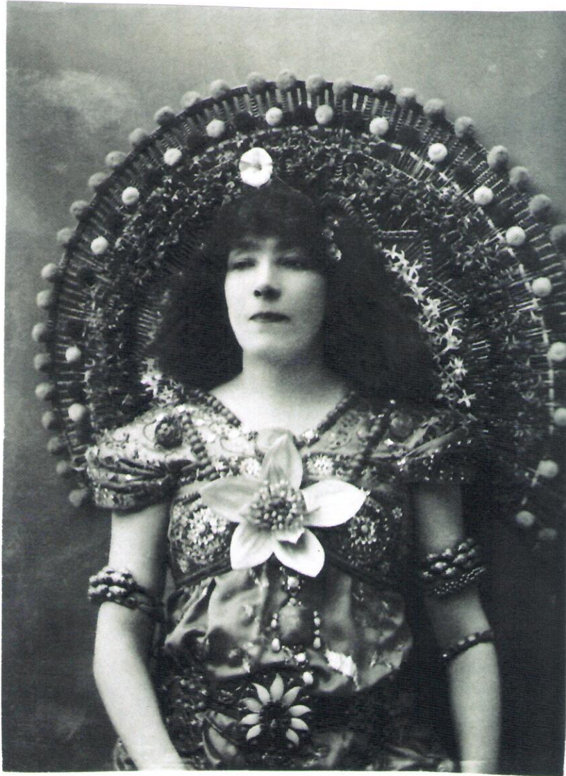
Fig. 17a) Nadar, Sarah Bernhardt as Izyel, 1894