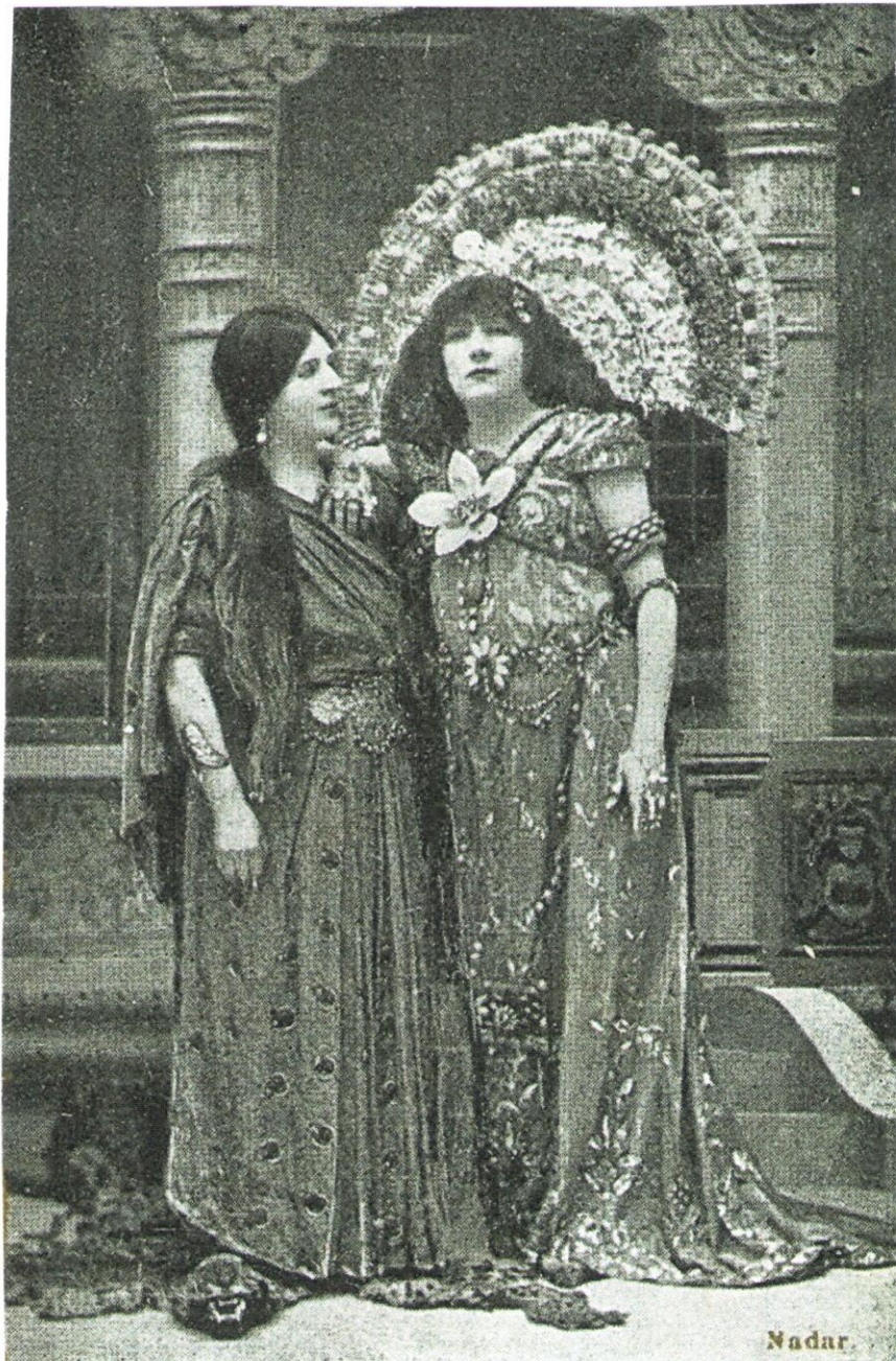
Fig. 17c) Nadar, Sarah Bernhardt as Izyl, 1894