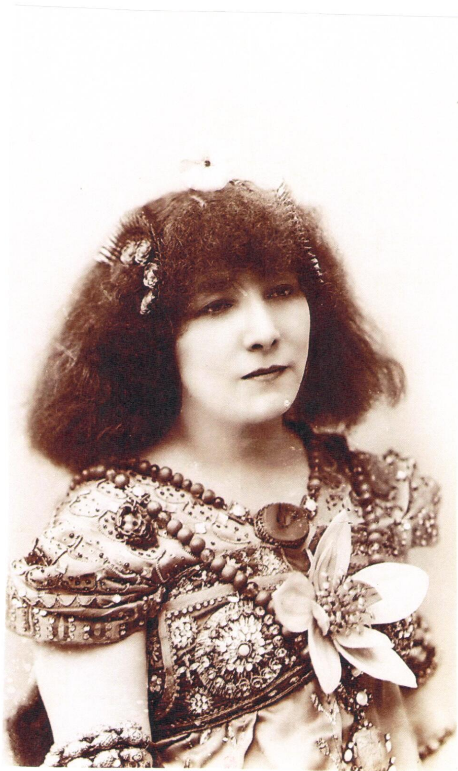
Figs. 14a-c) F. Nadar, photographs of Sarah Bernhardt in the role of Izyl, 1894