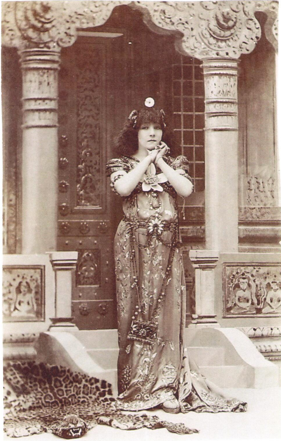
Figs. 14a-c) F. Nadar, photographs of Sarah Bernhardt in the role of Izyel, 1894