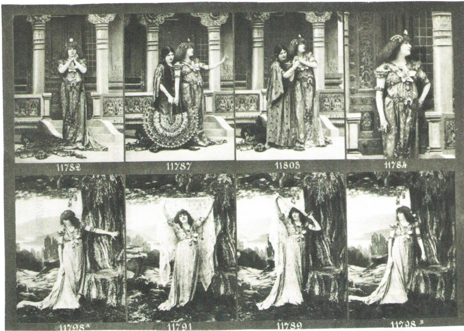
Figs. 14a-c) F. Nadar, photographs of Sarah Bernhardt in the role of Izyel, 1894