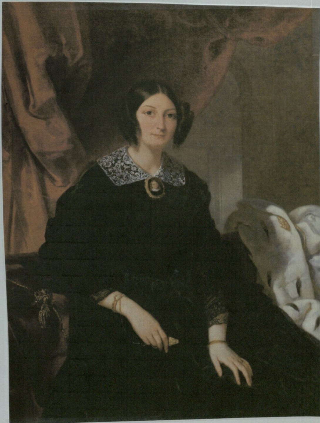
Fig. 2) E. Devéria, Portrait of Madame de Champfeu , oil on canvas, 1842, Musée de Moulins.