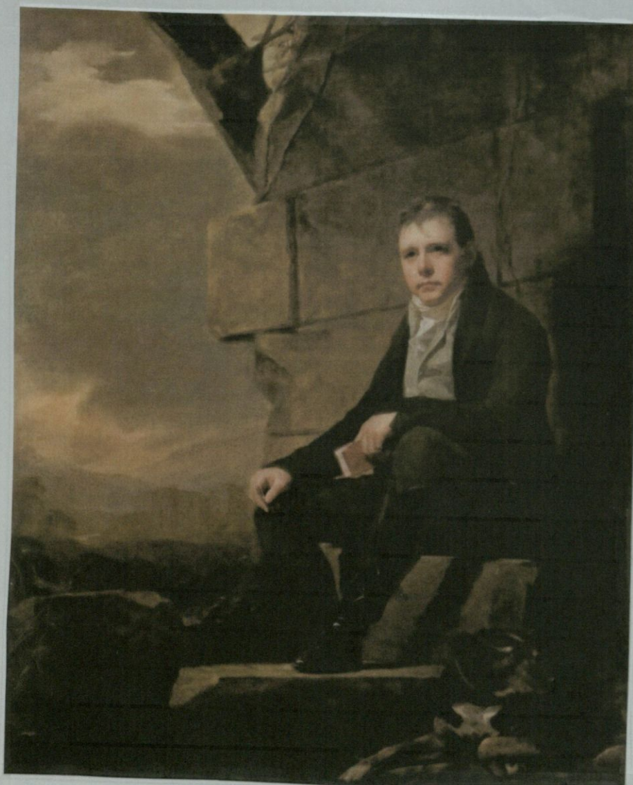
Fig. 5) Sir. H. Raeburn, Portrait of Sir Walter Scott , oil on canvas, 1808-09, Duke of Buccleuch Collection.