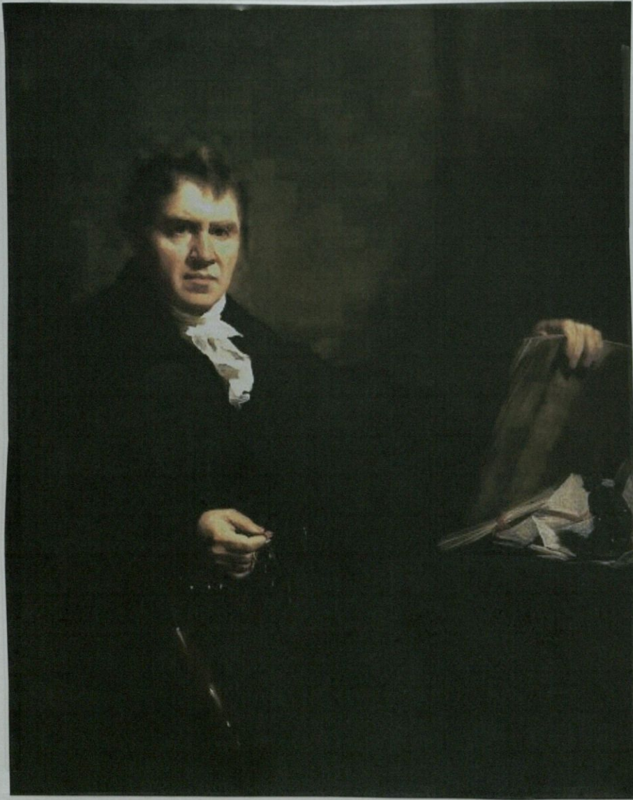
Fig. 3) Sir. H. Raeburn, Portrait of Lord Eldin , oil on canvas, ca. 1815, Scottish National Portrait Gallery, Edinburgh.