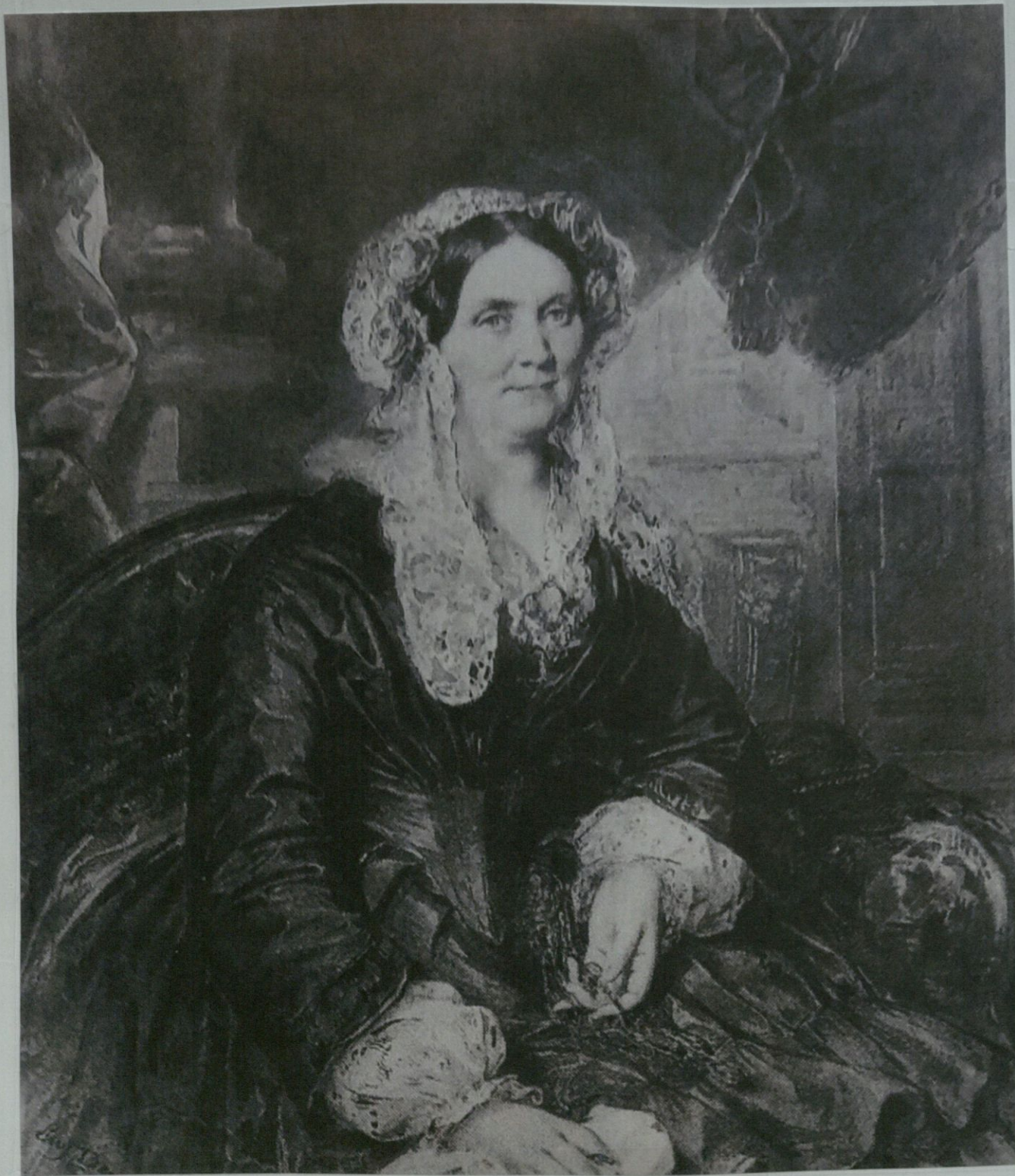
Fig. 1) E. Devéria, Portrait of the Grand Duchess Stephanie de Bade , watercolor, 1849-50, Brodick Castle.