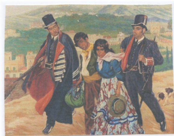
Fig. 12) Carlos Vázquez Úbeda, La detenida , oil on canvas, 1937.