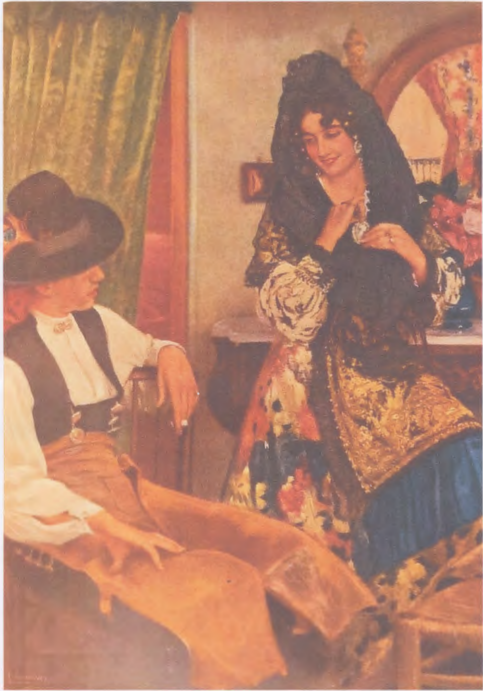
Fig. 6) Carlos Vázquez Úbeda, The Wedding Present , oil on canvas