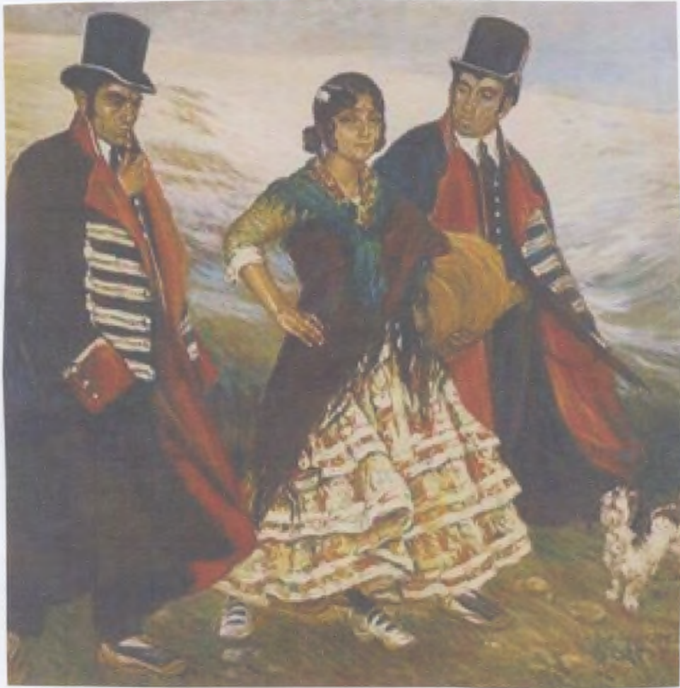
Fig. 13) Carlos Vázquez Úbeda, La detenida , oil on canvas, 1937.