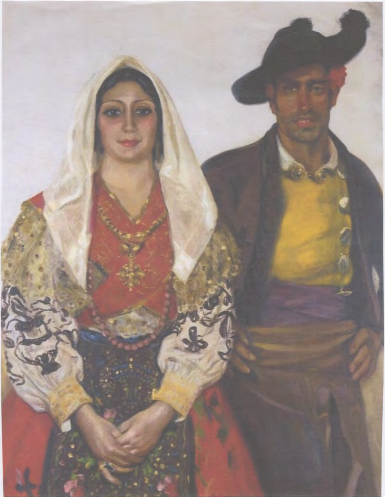
Fig. 4) Carlos Vázquez Úbeda, A Couple from Extremadura , oil on canvas.