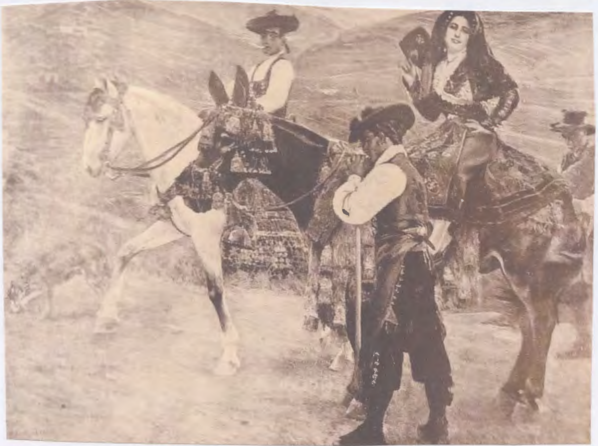
Fig. 7a -b) Carlos Vázquez Úbeda, The Mother in Law and Going to the Fair at Salamanca , oils on canvas