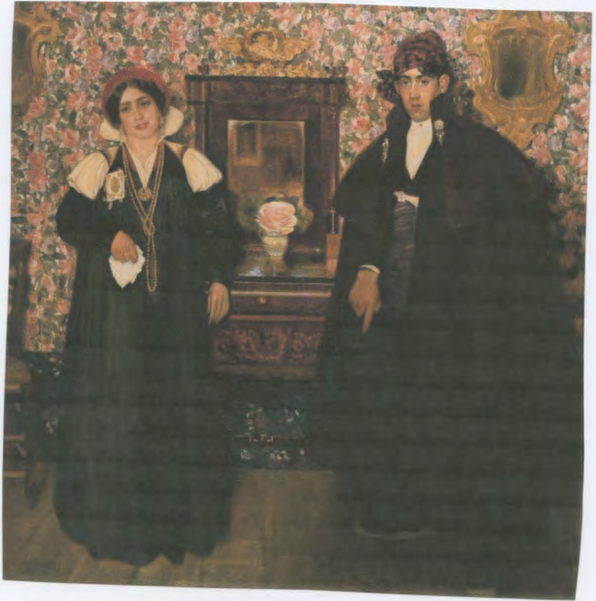
Fig. 9) Carlos Vázquez Úbeda, The Honeymoon in Ansó , oil on canvas, 1911, Hispanic Society of America, New York.