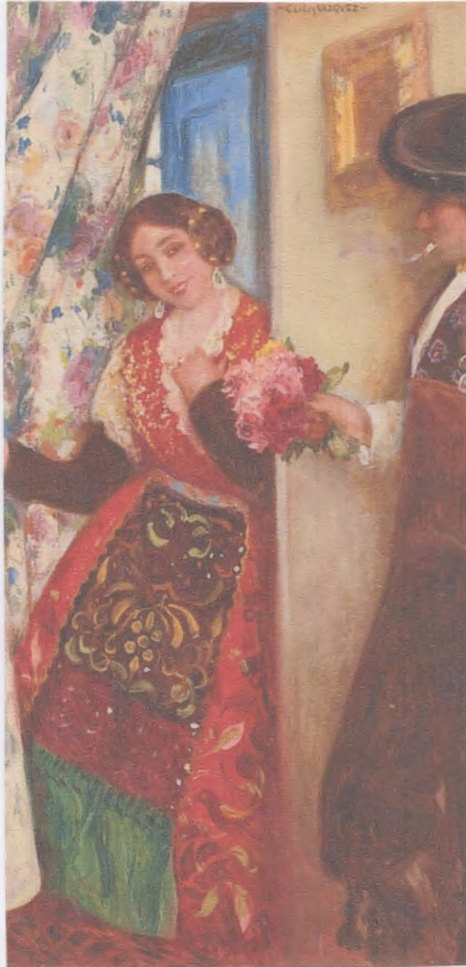
Fig. 2) Carlos Vázquez Ubeda, Roses Have Thorns , oil on paper, 1911.