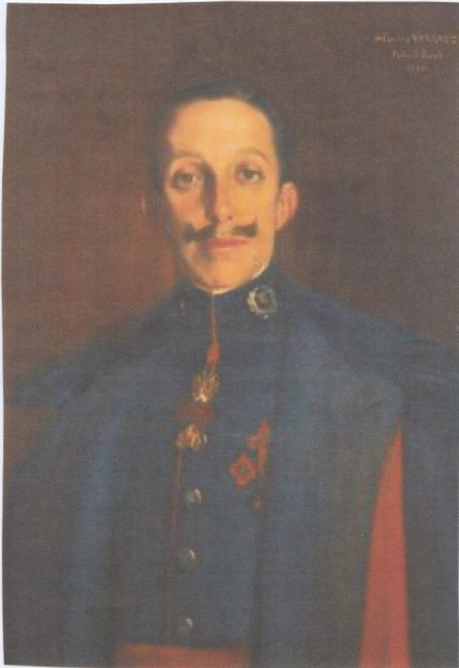
Fig. 8b) Carlos Vázquez Úbeda, Portrait of King Alfonso III , oil on canvas, 1926.