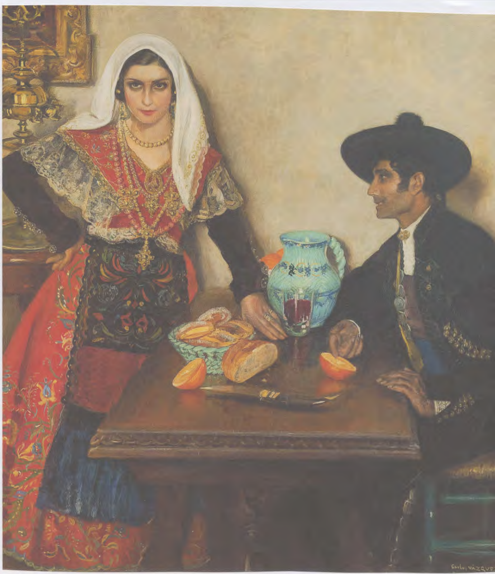
Fig. 5) Carlos Vázquez Úbeda, Spanish Couple at Table , oil on canvas.