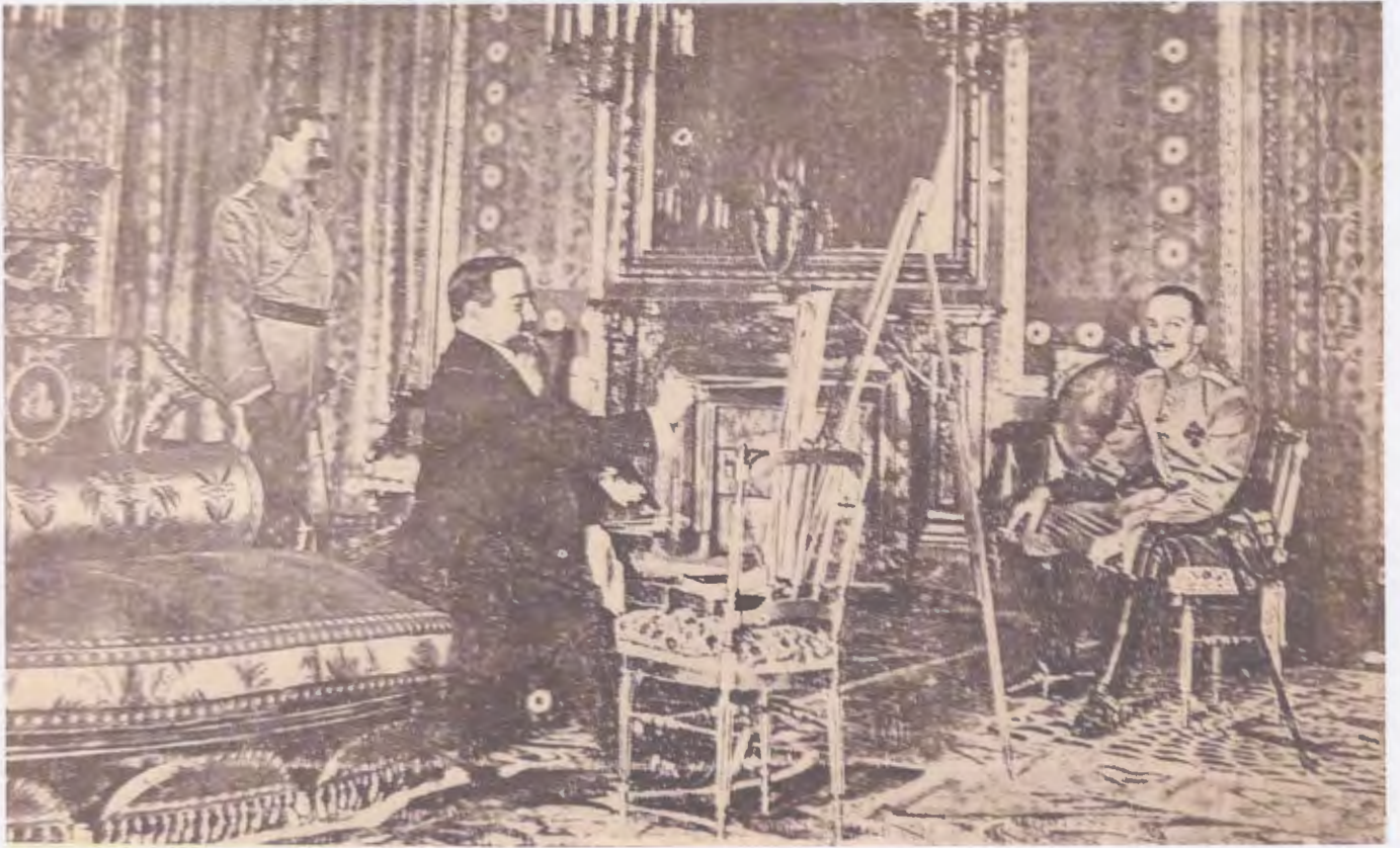
Fig. 8a) Carlos Vázquez Úbeda painting the Portrait of King Alfonso III , 1926