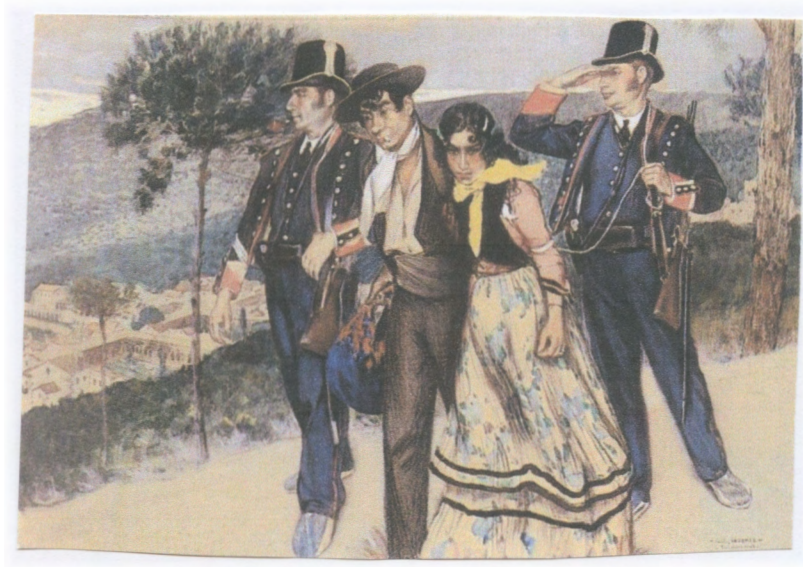
Fig. 11) Carlos Vázquez Úbeda, Catalan Police Arresting Gypsies , pastel, 1906.